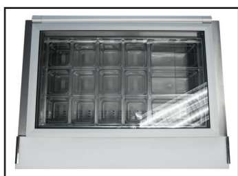
Glass Lid Top

This product is equipped with a fine mesh filter to the front of the condenser to catch dust, and a rotating brush that moves up and down daily to remove excess buildup outward and away.