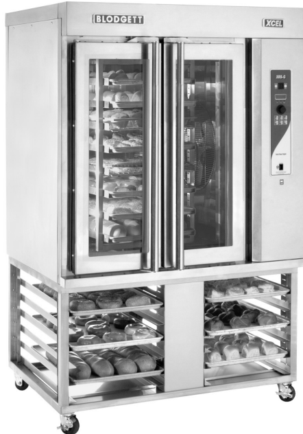
XR8-G with 12 pan stand